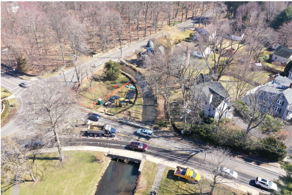
Aerial view of Sound Beach Avenue Bridge

Greenwich, CT., April 5, 2022 – Town of Greenwich Department of Public Works is announcing that major construction on the Sound Beach Avenue Bridge will commence on April 11, 2022. A temporary vehicular detour utilizing Harding Road and Forest Avenue will be in effect from April 11, 2022, to July 1, 2022 . Pedestrians will be routed through Binney Park during construction.